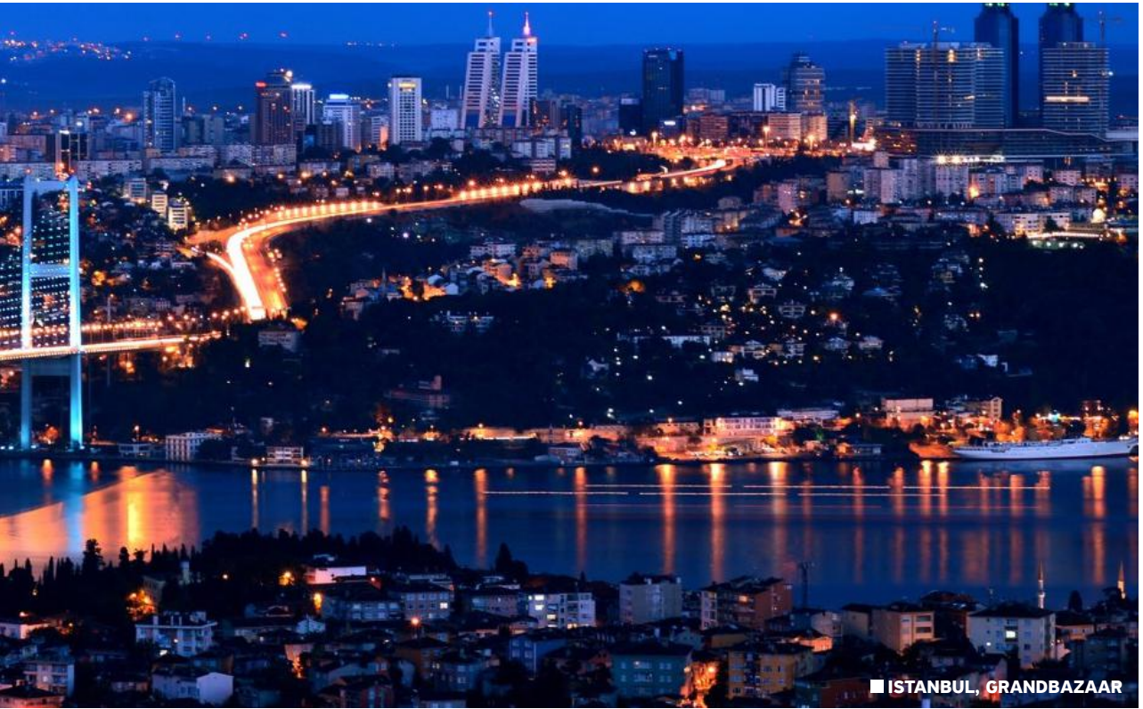
■ ISTANBUL, GRANDBAZAAR